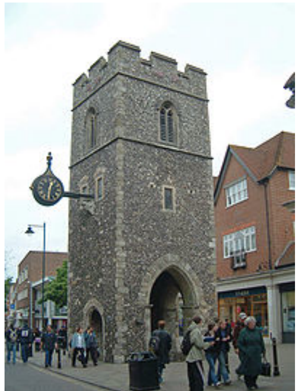
Marlowe was baptised at St George's Church, in Canterbury, on 26 February 1564